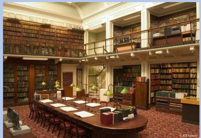
The Royal Irish Academy Library.

You can read Ken’s article “The Oldest Stamp Collection: A Sequel” online .