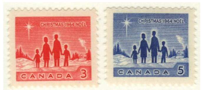
Figure 2: Canada Scott 434 and 435