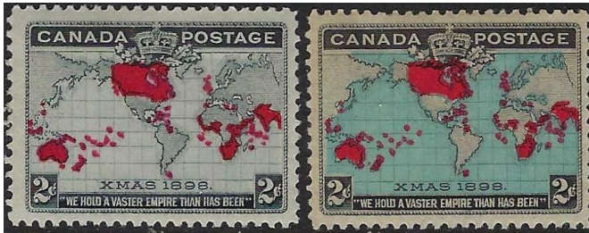
Figure 1: Canada Scott 85 & 86

A little more than a year ago, I wrote an article (see pp. 8-9, The Greater Philadelphia Stamp & Collectors Club Newsletter, December 2023 ) about Christmas stamps and revealed that the first Christmas stamps were issued by Canada in 1898 (Figure 1).